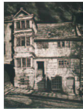
The House of Mystery , 1926. Sydney Lee.