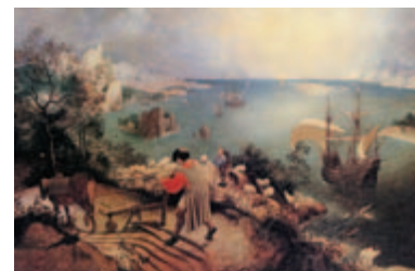
Landscape with the Fall of Icarus , c.1558. Pieter Bruegel.