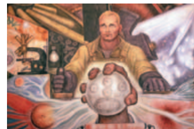
Man at the Crossroads , 1934. Diego Rivera.